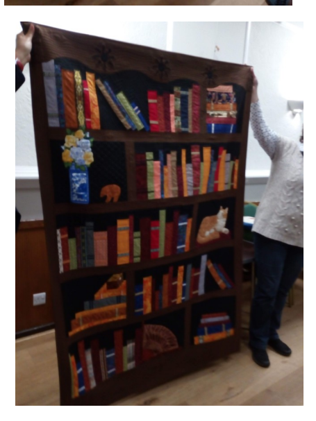
Show and Tell from our very talented Members!